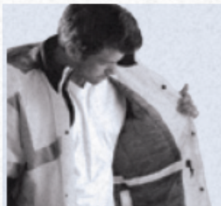
Thermal insulation with side-snapped opening.