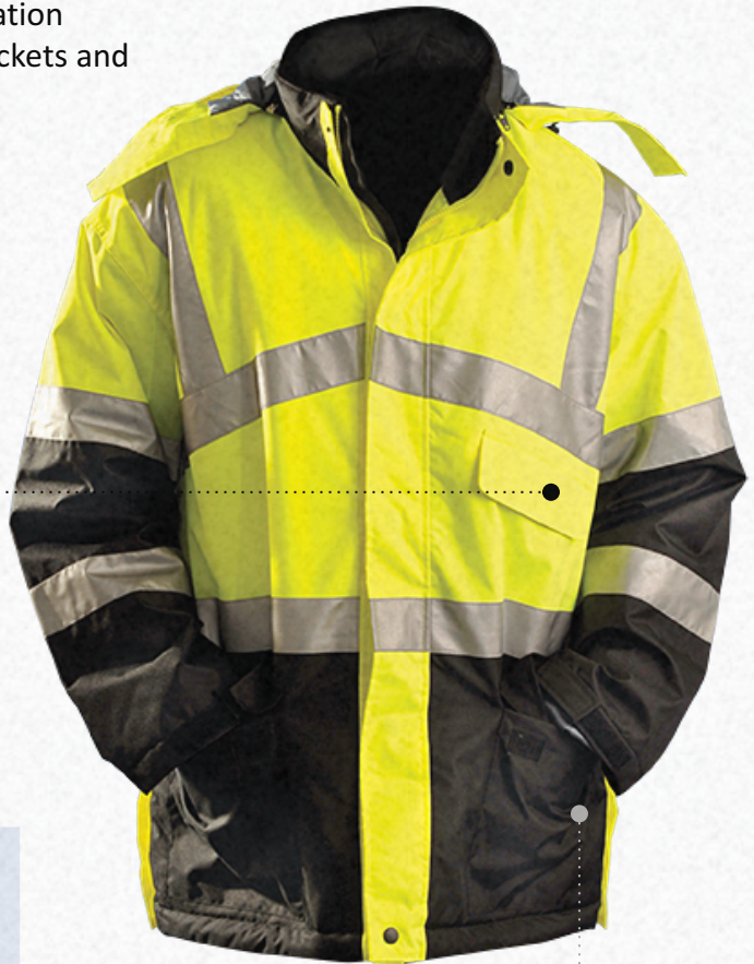
1 left chest pocket