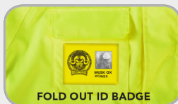
FOLD OUT ID BADGE