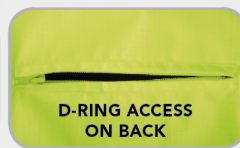
D-RING ACCESS ON BACK